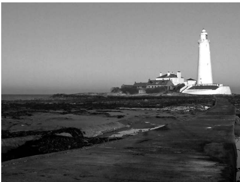
St. Mary's Island and Lighthouse, Whitley Bay - January 2009