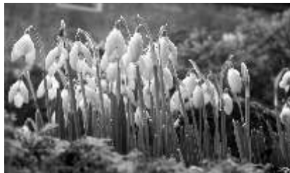
First Snowdrops - have you seen any yet?