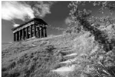
Penshaw Monument, Sunderland